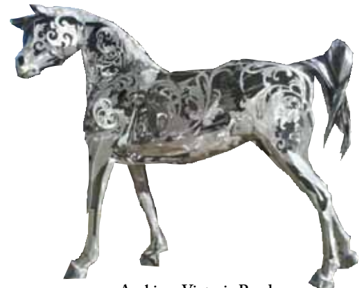
Arabian, Victoria Reed

"Inspired Visions" temporary art exhibit will be on display from April to October 2011.