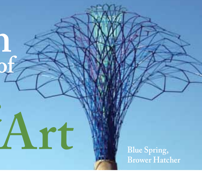
Blue Spring, Brower Hatcher